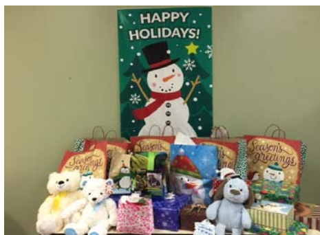
Presents for the kids!