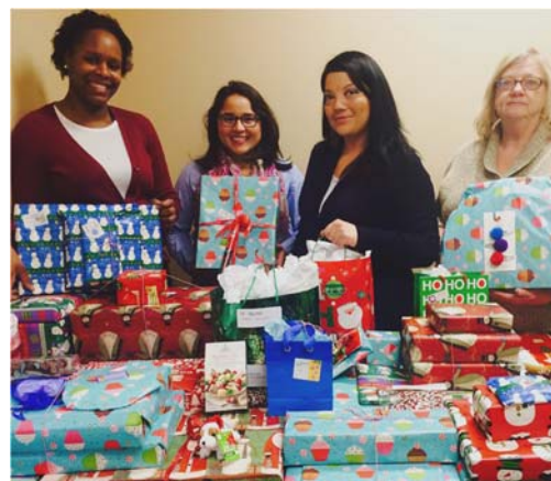
Family Services counting the donations!